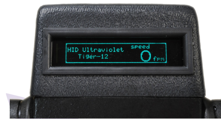
Multiple languages supported

Every HID design is the result of over 35 years of expertise designing and manufacturing ultraviolet equipment.