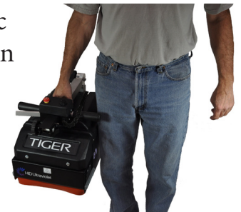
Light-weight and compact

HID's industry-leading safety features including: automatic safety shutoff for excessive tilt angle, non-movement, open covers, incorrect line input voltage, and cooling system deviation are all standard.